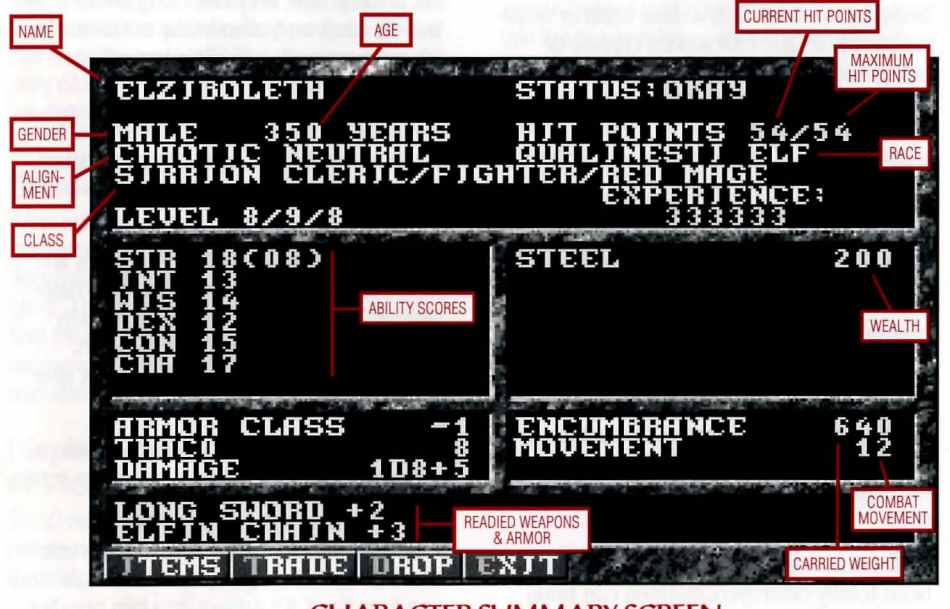
CHARACTER SUMMARY SCREEN

The Character Summary Screen is displayed anytime you select the VIEW command. This screen displays important information about a character, such as ability scores, current