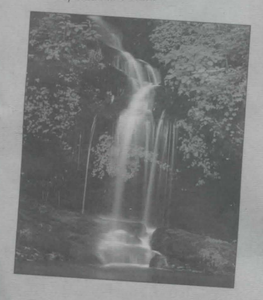
SQUEEZE into the wonderful Mossy Furrow at the end of Skidmark Trail!