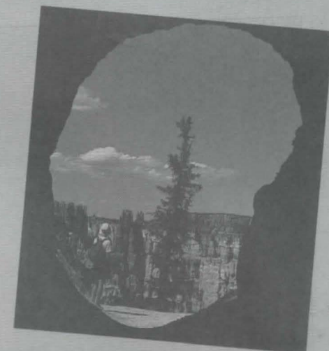
SPEND 5 minutes in the disorienting Tumbling Tunnel...when you get home, you'll swear to your friends it took you an hour-and-a-half!