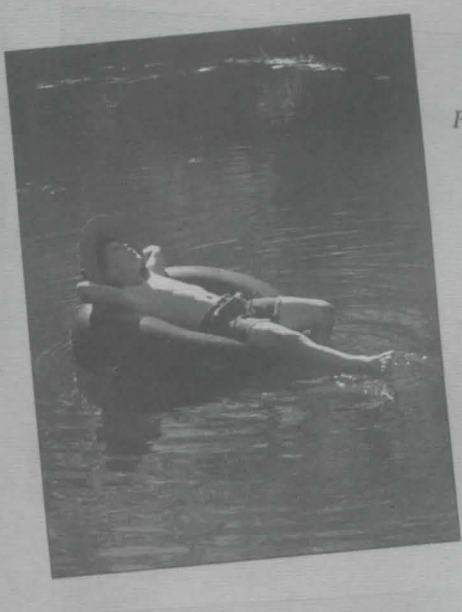
PLUNGE headfirst into the soothing Backdoor Basin!

Nestled in the bush just shooting distance from warm, inviting Beaver Creek, the bizarre yet strangely satisfying MYSTERY HOLE beckons.