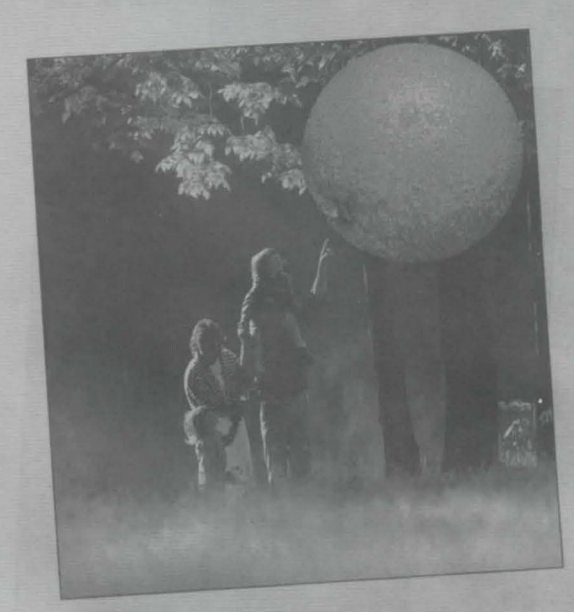
SEE objects swell to 5 TIMES THEIR ORIGINAL size... Then, just as mysteriously, wither back again!