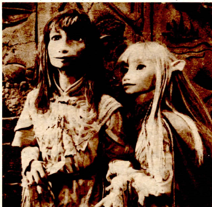
Jen and Kira with Shard

UrSu knew that whenever a Mystic died in the Valley, a Skeksis died in the castle, for their bodies were divided but their souls were still linked. Thus, when the Great Conjunction at last grew near, the Master allowed himself to die, knowing that this would also mean the death of skekSo, the Emperor of the Skeksis, and that the Skeksis must then fall into utter division. And indeed, with skekSo dead, the rivalries concealed for fear of his power broke out at once. SkekUng, the Garthim-Master, and skekSil, the Chamberlain, fell into open quarrel.