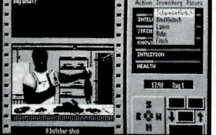
The Butcher of Berlin (EGA)