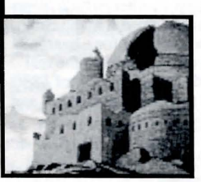
Digitized graphics of the magic

The 33-page manual is one of the best from EA in eons (and no won-