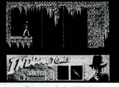
Ropes & ladders

Play level is for beginning to intermediate arcade champs, although the endurance level needed to complete the whole thing is superhuman. You may pause or abort the game, but you can't save it. I played