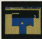
Going for a Swim?

Superior Software Ltd., Regent House, Skinner Lane, Leeds LS7 1AX. Tel: (0532) 459453