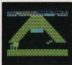
Visiting the Elephant House