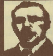
Conan Doyle Room 102