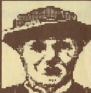
Thomas Edison Room 122