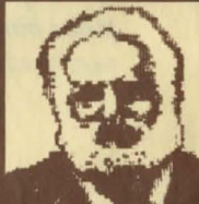
Alexander G. Bell Room 123