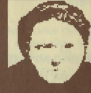
Gertrude Stein Room 115