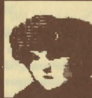
Lady Astor Room 201