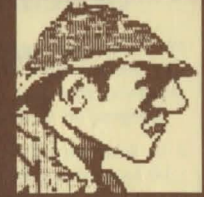
William Gillette Room 103