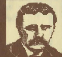
Tareyton Jr. Room 125