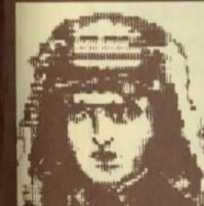
Col. T.E. Lawrence Room 119