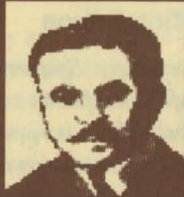
Lord Astor Room 201