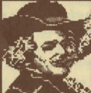
Tareyton Sr. Room 117