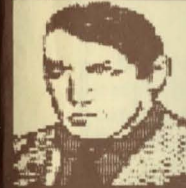
Picasso Room 114