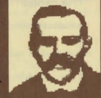
Baron Rothschild Room 109