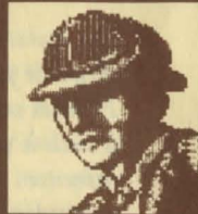
Sherlock Holmes Room 101