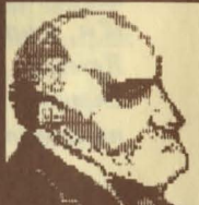
Leopold Auer Room 118