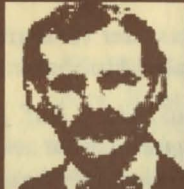
Henry Ford Room 105