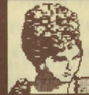
Lady Doyle Room 102