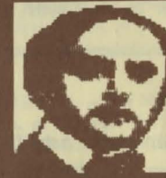
Harry Houdini Room 108