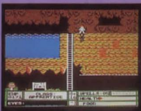
Screen shots from CBM64/128 version.