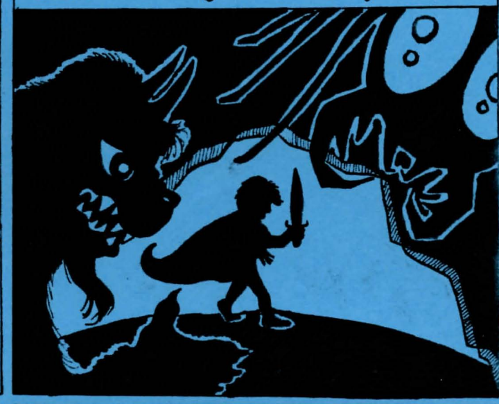
"talismans of magic? - what use be they - if any?