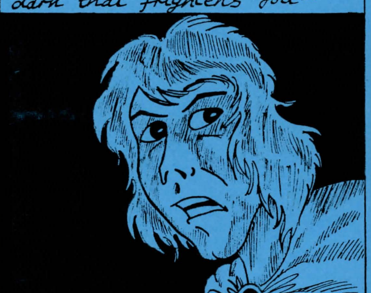
Doors close - hindering your journey ... disorientating you ...