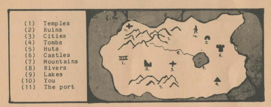
FIGURE 1 AN ISLAND

NOTE: While the topographical features of the island remain fixed the locations of items 1\,-\,6 vary with each quest.