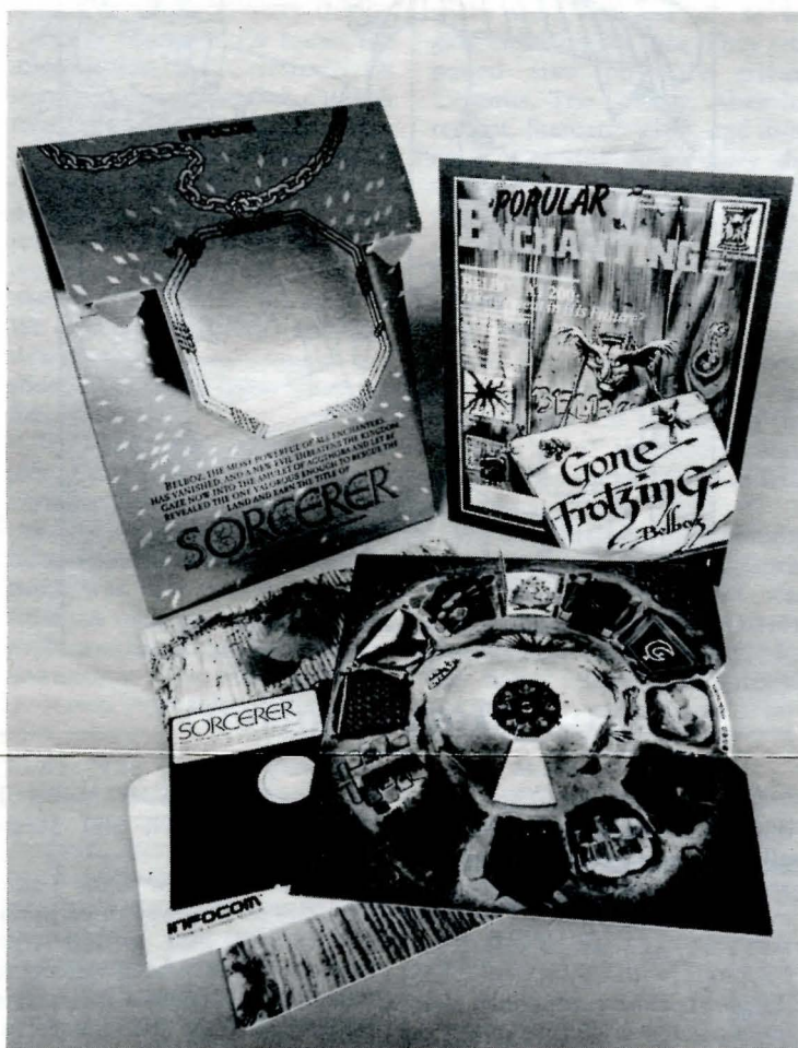
Included in the Sorcerer package you will find an issue of Popular Enchanting Magazine , the Creatures of Frobozz Infotater , and a handy storage pouch.