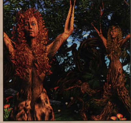
"The Dryad Woods" by Brandee Prugl

The second Rite of Rulership. Having freed the villages, you must now root out the neighboring warlord whose troops are wreaking havoc among your people. You march towards the fortress and gather your courage. Thoughts turn to the homeland you're avenging. Battle lines are drawn, and the conquest is on.