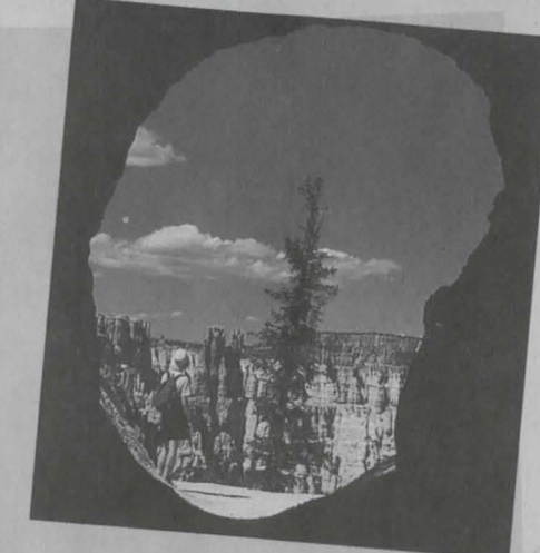
SPEND 5 minutes in the disorienting Tumbling Tunnel...when you get home, you'll swear to your friends it took you an hour-and-a-half!