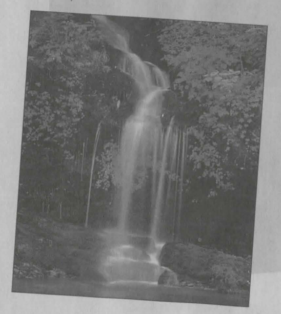
SQUEEZE into the wonderful Mossy Furrow at the end of Skidmark Trail!