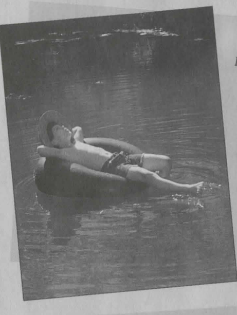
PLUNGE headfirst into the soothing Backdoor Basin!

Nestled in the bush just shooting distance from warm, inviting Beaver Creek, the bizarre yet strangely satisfying MYSTERY HOLE beckons.