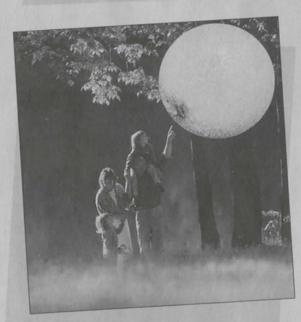
SEE objects swell to 5 TIMES THEIR ORIGINAL size... Then, just as mysteriously, wither back again!