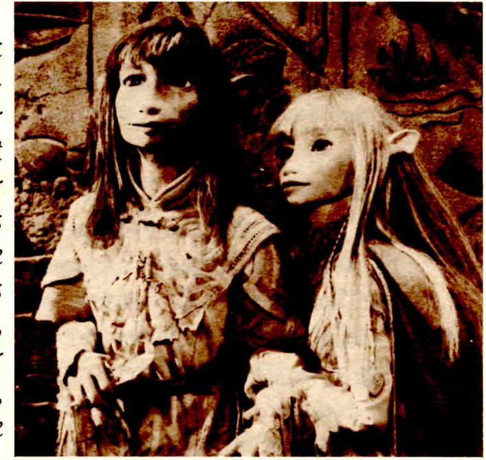
Jen and Kira with Shard

UrSu knew that whenever a Mystic died in the Valley, a Skeksis died in the castle, for their bodies were divided but their souls were still linked. Thus, when the Great Conjunction at last grew near, the Master allowed himself to die, knowing that this would also mean the death of skekSo, the Emperor of the Skeksis, and that the Skeksis must then fall into utter division. And indeed, with skekSo dead, the rivalries concealed for fear of his power broke out at once. SkekUng, the Garthim-Master, and skekSil, the Chamberlain, fell into open quarrel.