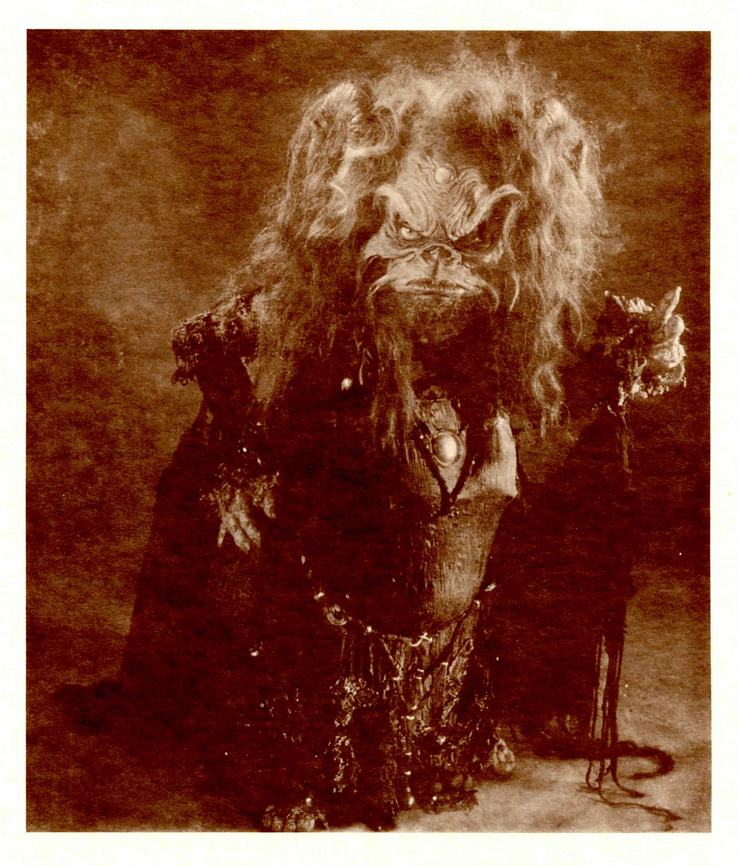
Of the race of Aughra, I, Aughra, am the first and last. This is my song.