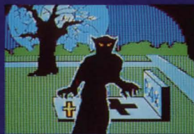
Scenes from Transylvania